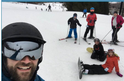
Trinity Ski Day