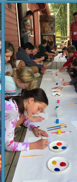
Beginning in the Middle