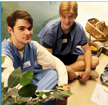
Four of the Fifteen youth who helped with Vacation Bible School 2019