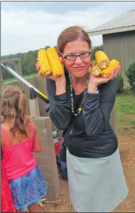
Eliada Corn Maze